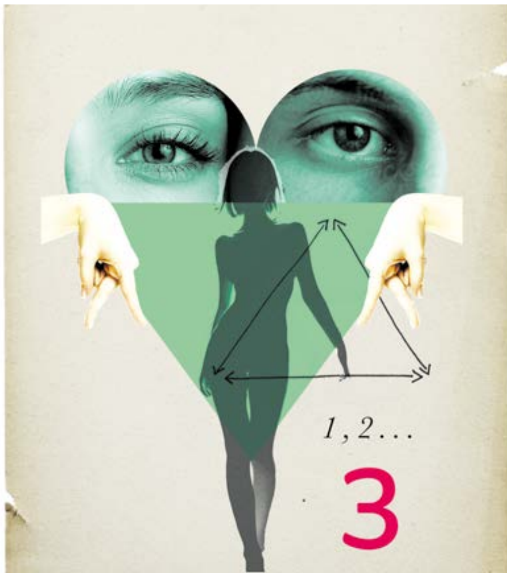
Collage: Simone Golob