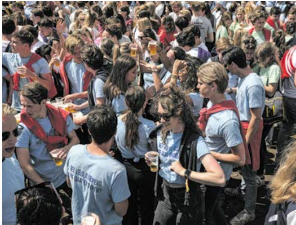
Archival image of student hockey tournament and festival Us Leef Vruike, in which traditionally many student societies participate

However, "nothing was revealed" that could be construed as misconduct as a result, said the chairs. Although, they did admit it is hard to judge: the university was not forthcoming with details about the reports, so what sort of behaviour was considered misconduct was something of a guess. It raises the question what concrete 'evidence' UM has to consider