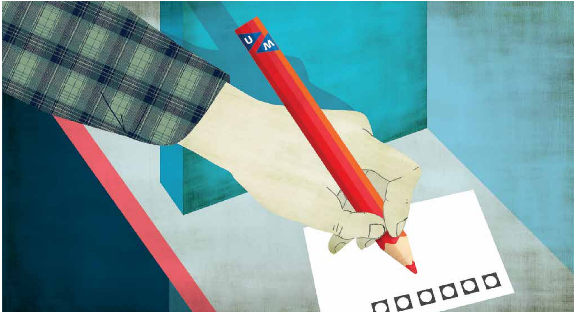
Illustration: Simone Golob